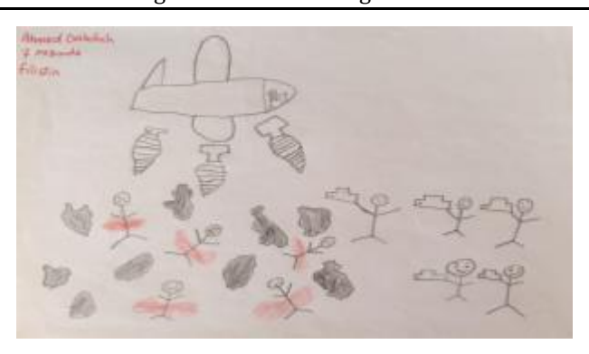
Picture 2. Drawing of the Palestinian refugee child on the theme of war and migration. (C6)