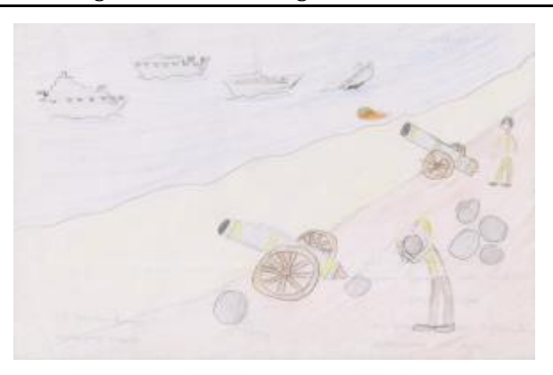
Picture 8. Drawing of the Turkish child on the theme of war and migration. (C43)

In another drawing by a Turkish child, we see relatively faint colors like browns and blues. The dominant use of brown may suggest the need for protection, care and affection while blue is an indicator of tranquility and harmony. Blue may also symbolize being neutral (Savas, 2014) as children tend to use moderate colors when they feel impartial about something. Therefore, it seems that the child remains neutral about war. However, the battleships being sunk by cannon fire are far from the battles of today. The child confirms the historical quality of the symbols by saying that the drawing represents the Gallipoli Campaign taking place between the national forces and the enemy. We see quite a lot of details, including the buttons on the soldiers' uniforms, dropping of anchors and the wheels of the cannon carriages. According to Yavuzer (2000), the drawings by 9-12-year-old children are more detailed and realistic. Here, we see quite detailed figures that look to have better anatomical proportions with clothes on them. Therefore, we can conclude that the child meets the milestones for his or her age.