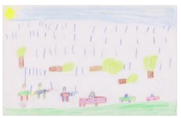
Picture 6. Drawing of the Turkish child on the theme of war and migration. (C34)

When we look at the drawing by a Turkish child, we see more symbols for war rather than immigration. However, when we look closely at it, we do not see any symbols for war except for the armed people shooting at each other. The people shooting guns and the dead people lying on the ground are all smiling. In real life, one cannot see happiness in people's faces in the middle of a battlefield but horror, pain and grief. Therefore, the child seems to use his imagination for the symbols of the war instead of his experiences. We see various bright colors. According to Burkit et al. (2003), children tend to use more colors for the figures they like and moderate colors when they feel neutral about something. Therefore, we can conclude that the child's perceptions of war are rather neutral and far from being negative and dreadful. There is a baseline colored in green, which shows that the child sees herself/himself as a part of the world. We can see natural elements like the sun, clouds and birds. The sun is a symbol of mother. A child cannot exist without his/her mother just like the Earth that cannot exist without the Sun. Sunny weather, clouds with light colors and birds represent happiness and joy of life (Savas, 2014). Therefore, the child seems to have positive feelings and mood (happiness, joy, etc.), which are reflected in his/her drawing.