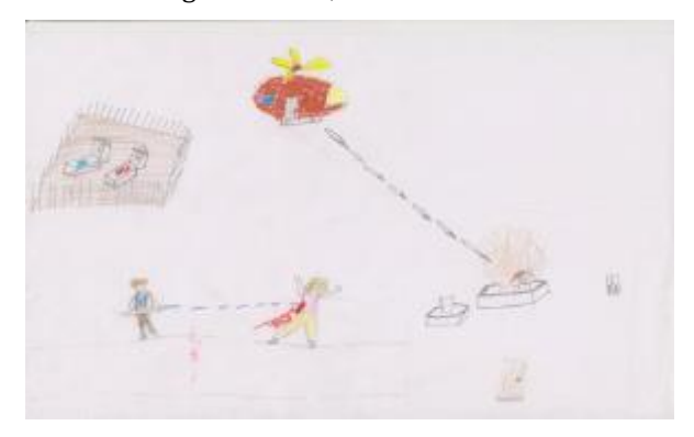
Picture 4. Drawing of the Syrian refugee child on the theme of war and migration. (C18)

Syrian child explains that, "The kids are playing football and the other child wants to join them but he can't. The planes are dropping bombs. All the kids are killed." In their daily lives while playing, they find themselves in the middle of chaos with buildings falling apart and bombs falling over them, which are reflections of traumas and devastation.