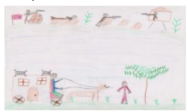
Picture 7. Drawing of the Turkish child on the theme of war and migration. (C39)

In another drawing by a Turkish child, we see both warfare and immigration. There are cars trying to escape from the armed people shooting at them. S/he wants to emphasize the symbols of the immigration following the war. There are no symbols of war in the drawing except for the armed people. S/he also tries to dilute the impact of the symbols by saying, "Their guns don't work because it's raining. Therefore, they cannot fire. So, the cars are able to run away." We see bright colors. As stated before, the warfare and immigration seem to evoke neutral feelings. The sky and ground are separated with colored lines. The elements in the drawing are placed below the baseline, which shows that the child has a sense of belonging to his/her environment. The cars as a symbol of immigration go from left to right. By age 7, children become more aware of time, space, and real life and future becomes more important than the past (Savas, 2014). We can also see trees in different sizes. According to Halmatov (2015), drawing a tree represents the unconsciously drawn self-portrait of the person. Drawing more than one tree may suggest that the child is worried about the existence (pressure) of the others. The trees with cut down trunks and branches give clues for destruction, sense of being lost and negative self-perception. So, the slanted trees, which are called "destroyed" by the child, seem to represent the destruction and losses caused by war.