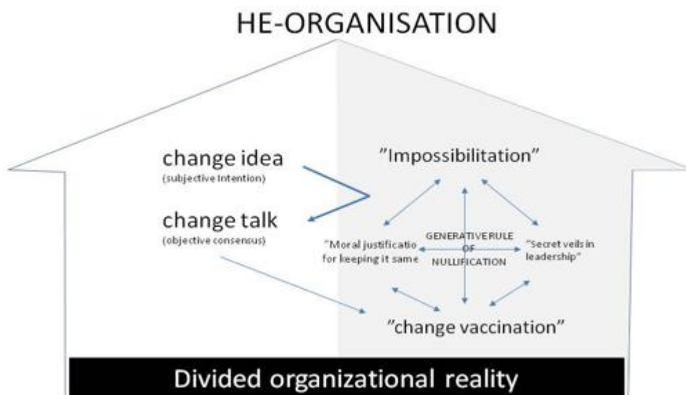
Figure 2. HE Teachers' Social Grammars. (Karjalainen & Nissilä, 2011)

The analysis was aided by the usage of the meaning matrix which was developed for revealing meaning structures in a written text (Appendix 1, Table 1; Karjalainen & Nissilä, 2011). It focuses on the meaning structures, either objective or subjective, either historical or universal, as well as their consciousness or unconsciousness (latent nature). (Karjalainen & Nissilä, 2011) The deep analyses concentrated on the possible organizational and personal development and change in HE. An in-depth example of an interpretative process explaining how a step-by-step process can be reconstrued and show different levels of individual meaning is given in Appendix 2. An overview of meaning structures concerning teachers' social grammar is given in Figure 2.