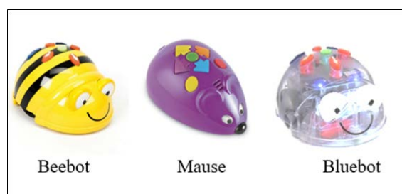
Figure 2. Robots Available in The Market for Early Childhood.