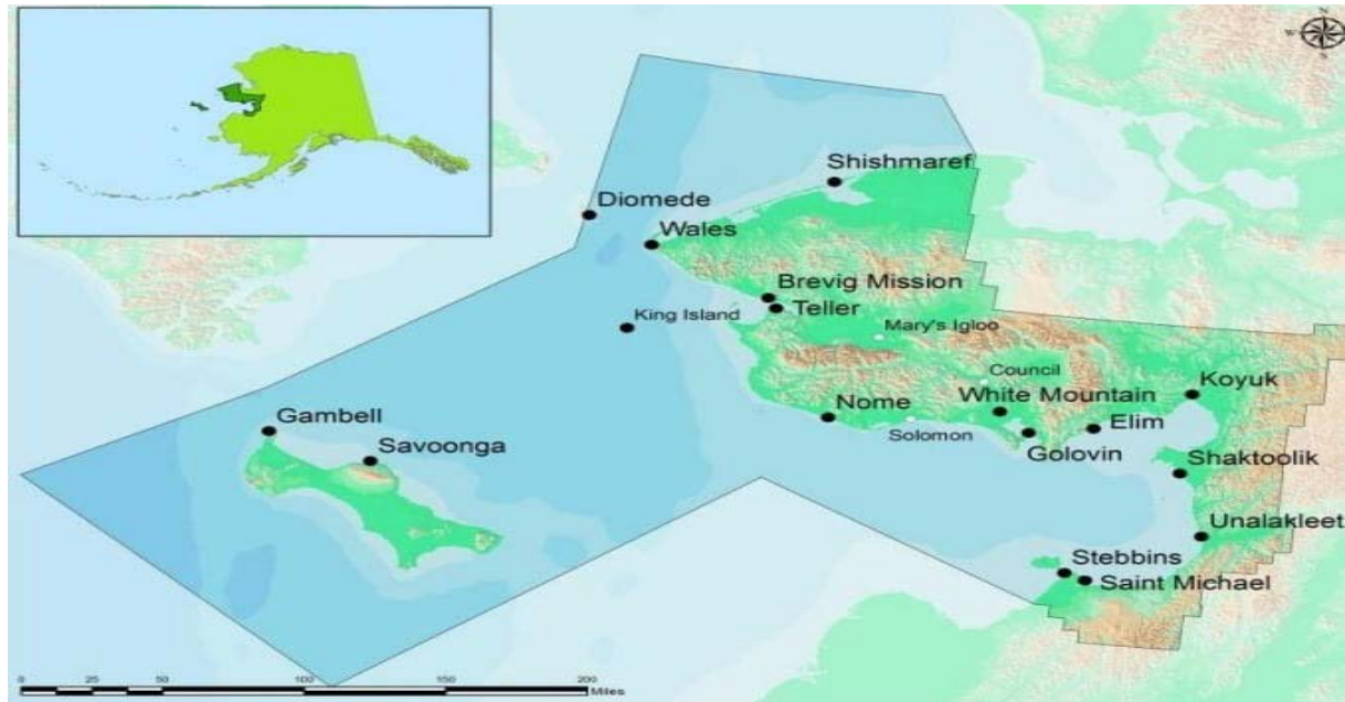
Figure 1. The Map of the Bering Strait Showing Where the Respondents' Schools Are Located

The district headquarters are in Unalakleet, Alaska. The district has over 170 certified teachers, 21 school principals and assistant principals, several district office administrators and program specialists, as well as several hundred classified support team members. The schools that are included in the study are: Aniquiin School, Anthony A. Andrews School, Brevig Mission School, Gambell School, Hogarth Kingeekuk Sr. Memorial School, James C Isabell School, Koyuk-Malimiut School, Martin L. Olson School, Shaktoolik School, Shismaref School, Tukurngailnuq School, Unalakleet School, Wales School, White Mountain School, and NACTEC. Figure 1 shows the map of Bering Strait where the respondent's schools are located.